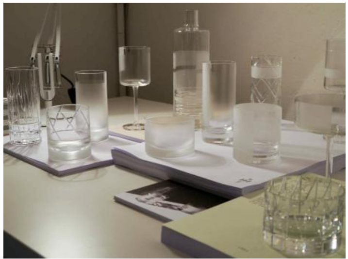
J. Hills Standard at Milan Design Week 2014