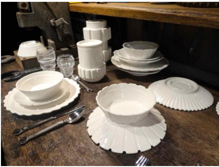
Diesel at Salone Internazionale del Mobile 2014