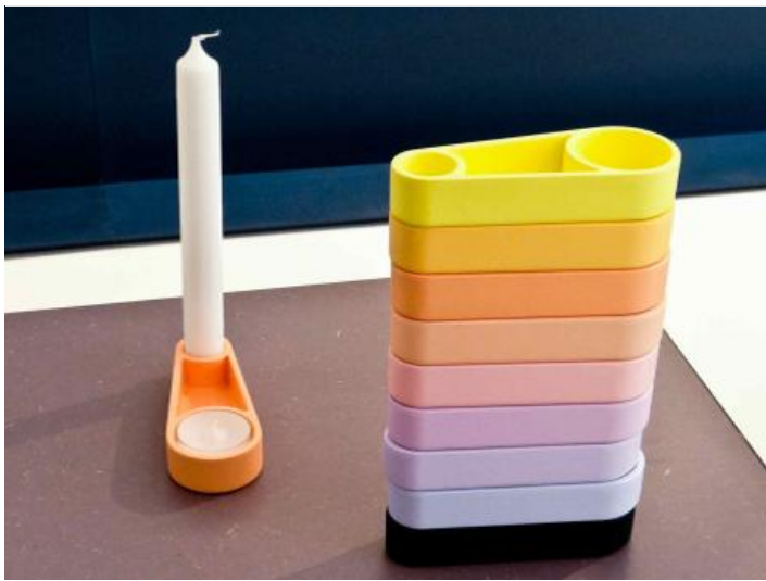
Hay at Milan Design Week 2014