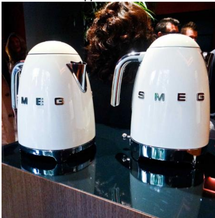
Smeg at Milan Design Week 2014