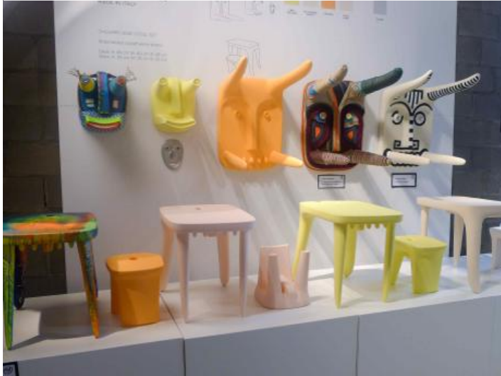
TOG at Milan Design Week 2014