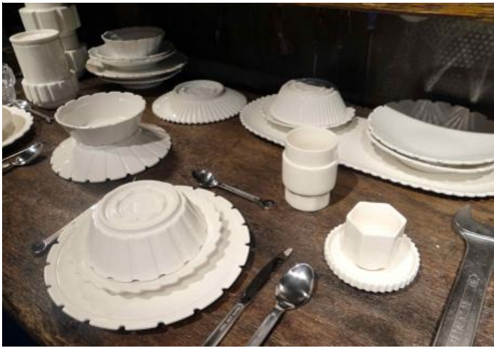
Diesel at Salone Internazionale del Mobile 2014